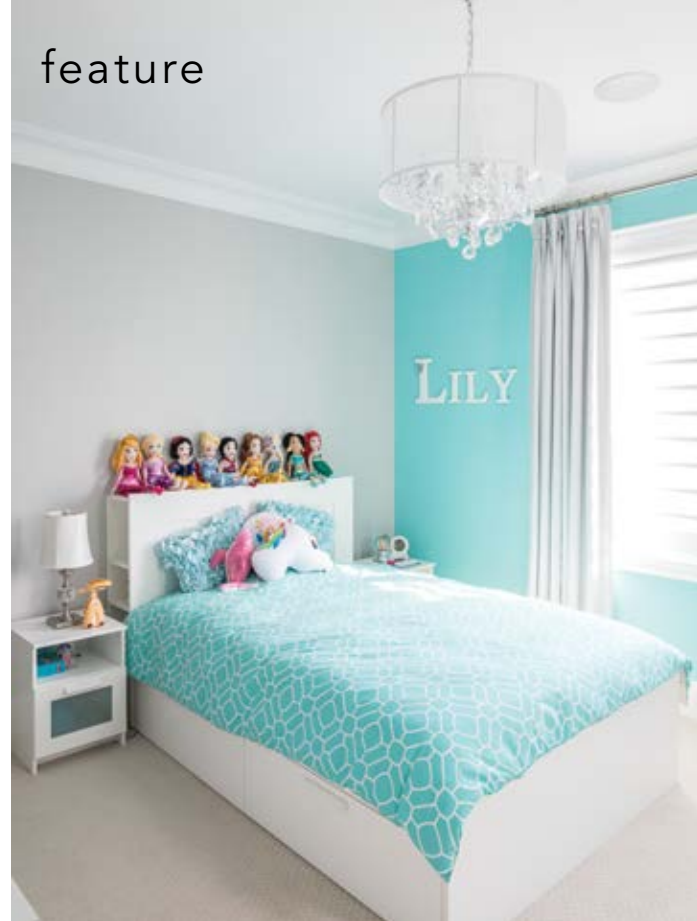
LEFT: A vibrant green-blue and plenty of dolls decorate a little girl's space. BOTTOM LEFT: A punch of vibrant pink adds personality. BOTTOM RIGHT: Vintage hot air balloons add a touch of whimsy to a baby boy's room.