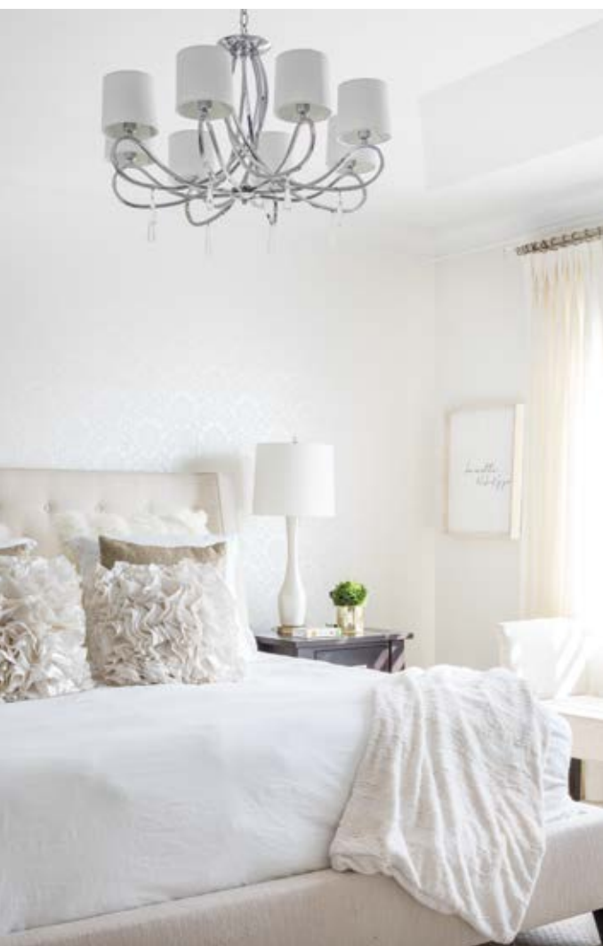
ABOVE: Tranquil blue walls and warm wood on the vanity create a spa-like en suite. LEFT: Soft textures and hues bring a sense of calm in the master bedroom. RIGHT: A geometric backsplash adds a little funkiness in the laundry room.